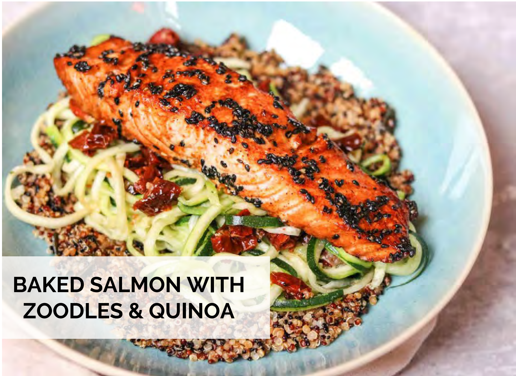
BAKED SALMON WITH ZOODLES & QUINOA