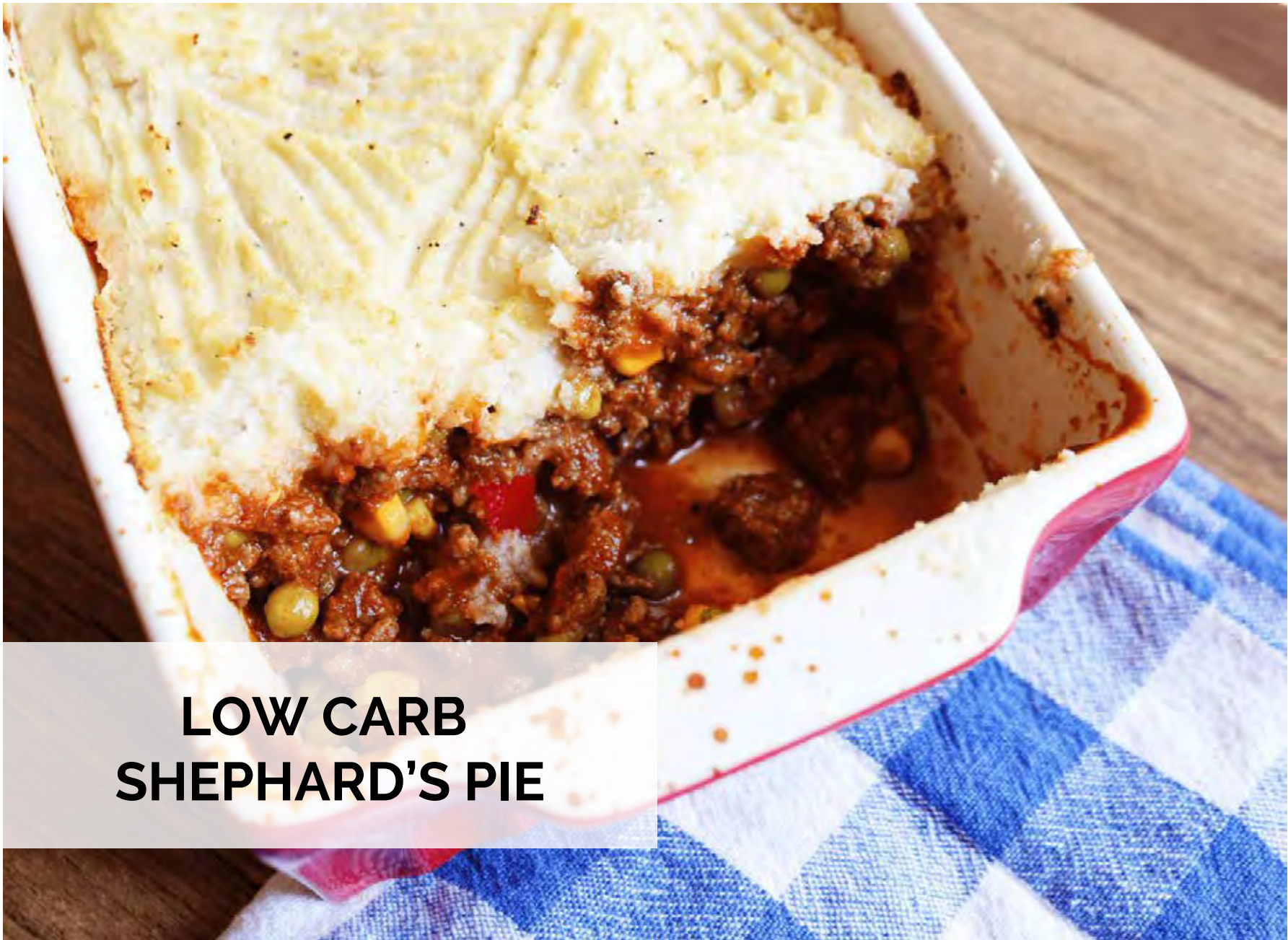
LOW CARB SHEPHARD'S PIE